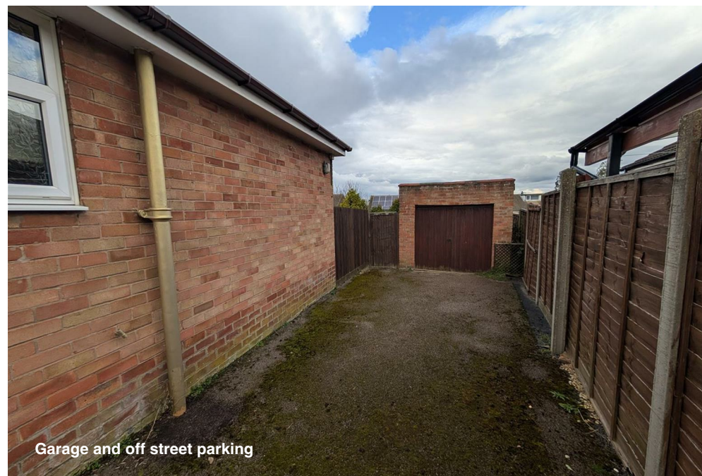
Garage and off street parking